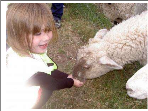
Feeding the sheep

We took the nursery children to Ferry Farm in Hoveringham for our visit this year. It was a very busy day but everyone really enjoyed it and lots of children said they'd like to go again!