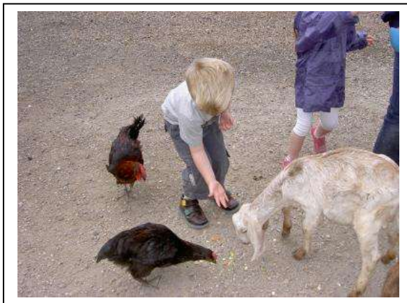
We fed goats and chickens in the farmyard.