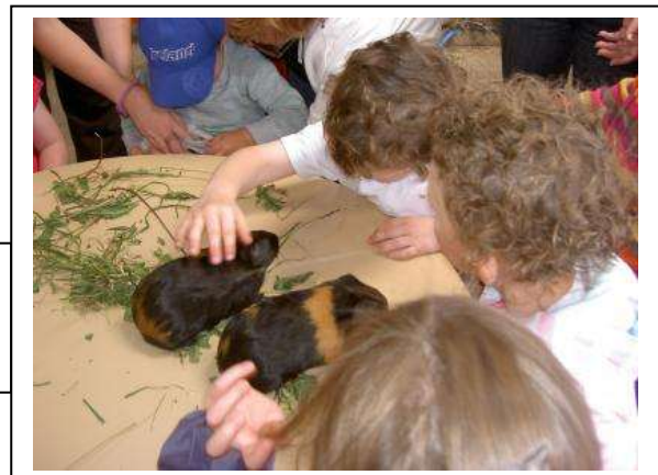
We could pet the small animals in the barn.